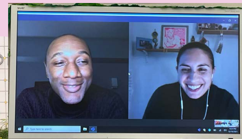
Aloe Blacc & Maya Jupiter